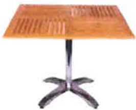
Teak Table Top with Base